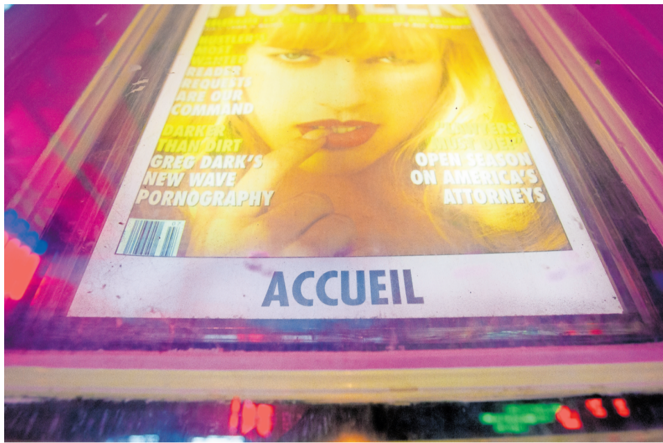
Larry Flynt's Hustler Club has filed a lawsuit seeking to overturn a ruling that the strip club's placement of 48 Hustler magazine covers on its club violate rules about signs in the French Quarter.

The lawsuit adds that the signs "are not distinguishable from displays found on the doors of the T-shirt shops neighboring the property, or the windows of antique or art dealers on Royal Street," and it says forced removal of the signs is a violation of